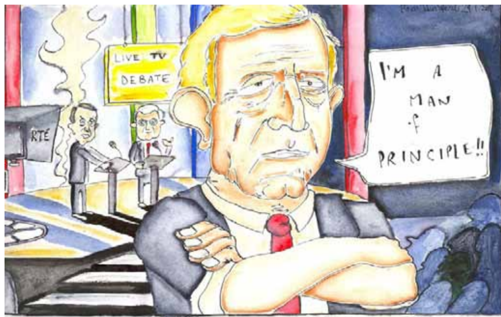
Pressure on Fine Gael's Enda Kenny to debate.

to lose their jobs not to mention thousands of primary and post primary teachers? If this isn't enough to move the Student Union leaderships into action and mobilise students what is?