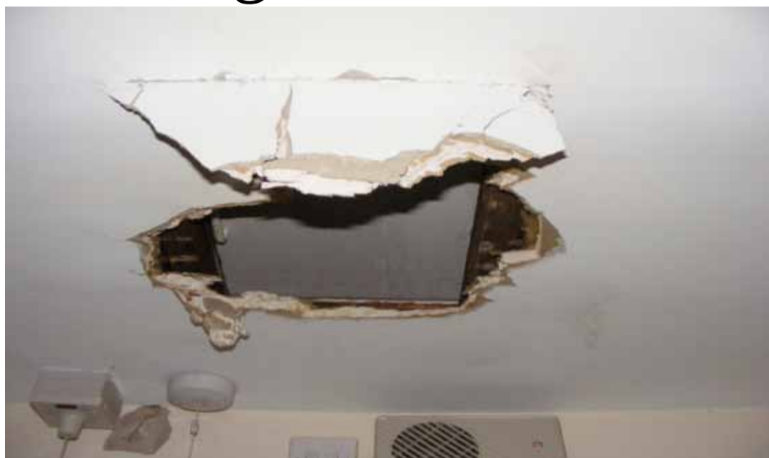
Winter conditions prevented numerous students from living in rented accommodation