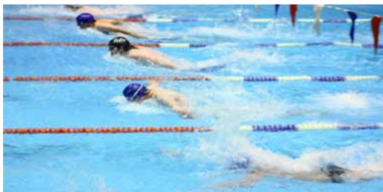
Swimming, Waterpolo and Lifesaving Club

Following the next gala the club have planned two weekends away, one for the upcoming swimming intervarsities in Kilkenny and the other for waterpolo intervarsities also to be held in Dublin.