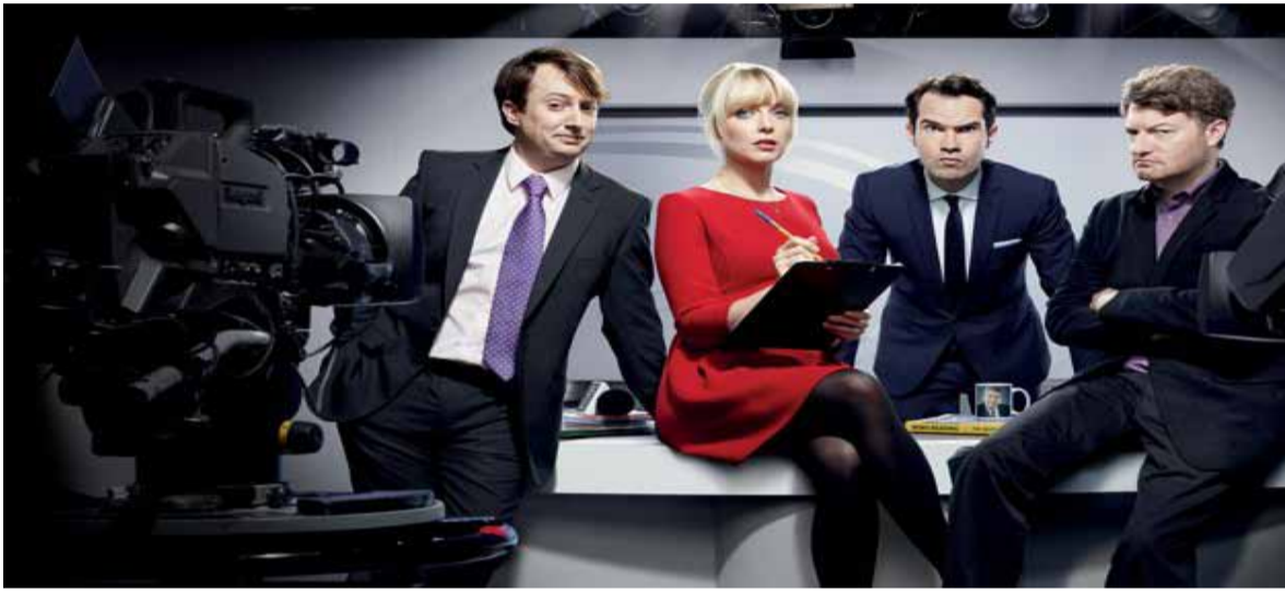
10 o'clock Live cast: David Mitchell, Lauren Laverne, Jimmy Carr and Charlie Brooker

a missed opportunity, but this would be a hasty judgement. It may be guilty of trying to combine too many styles (and egos), as almost every segment was cut frustratingly short, but it shows promise as a platform for entertainment to be reconciled with serious discussion of current affairs. This is certainly a welcome challenge to the current dominance of identical panel shows, in which identical comedians make identical jokes about the same easy targets.