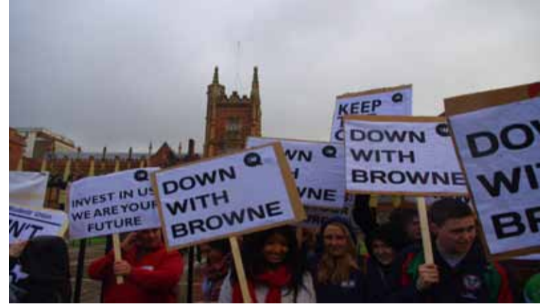
Students protest outside Queen's in October of last year

The NUS-USI will also be seeking to educate students on the stances of the respective political parties standing for election towards fees in order for them to make an informed decision on the issue, rather than voting along usual political ties.